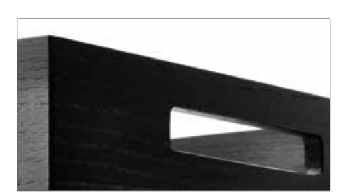
Ash-tree black, varnished

Variable dividers made of powder coated metal in graphite colours