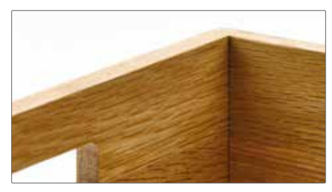
Bright oak, varnished